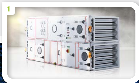
Wolf large air conditioning unit